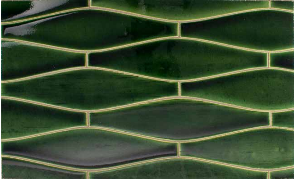
G1-114 Portland Lg. Elongated Ogee RC210

We're pleased to introduce the Portland field option to our tile offering! Both the surface and edge of Portland field tile reveal the unique markings acquired through the handmade production process. These characteristic traits are what make Portland field so appealing and beautiful.